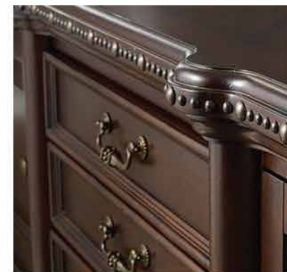
General Furniture Polish & Care