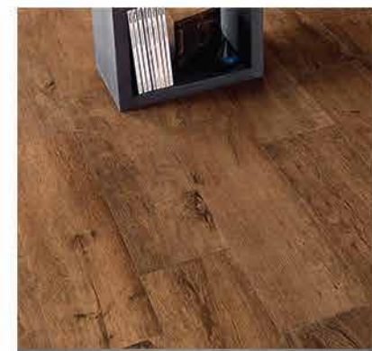
Decking Flooring polishing