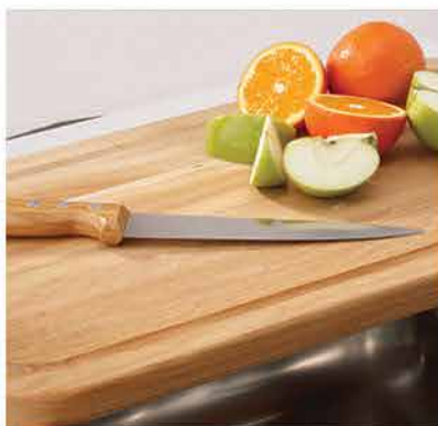
Wooden kitchenwear Polish & Care